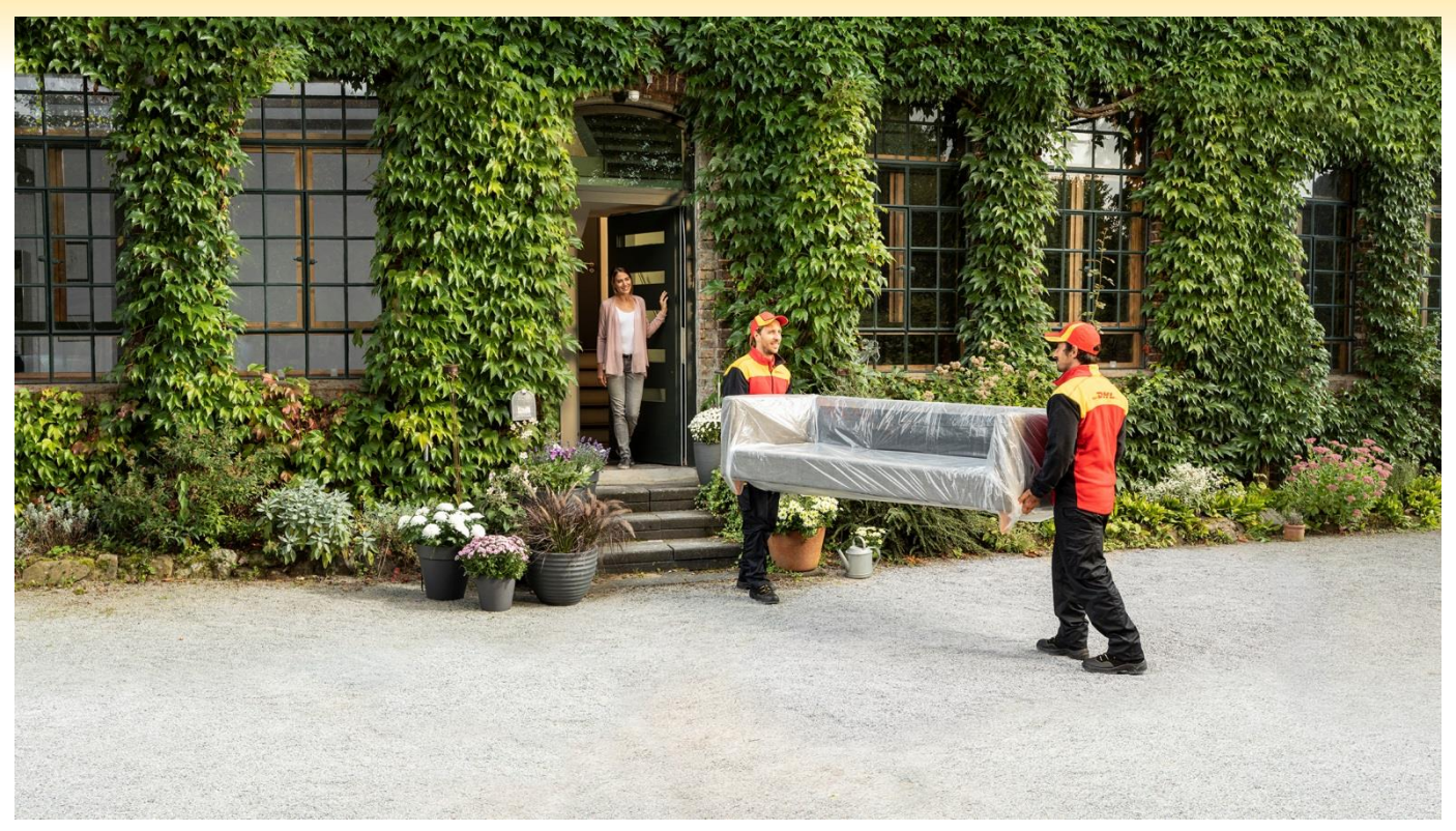
DHL 2-Mann-Handling is the reliable logistics solution for bulky, heavy and fragile goods. We offer you individual logistics solutions from shipping to installation or assembly at the point of delivery.